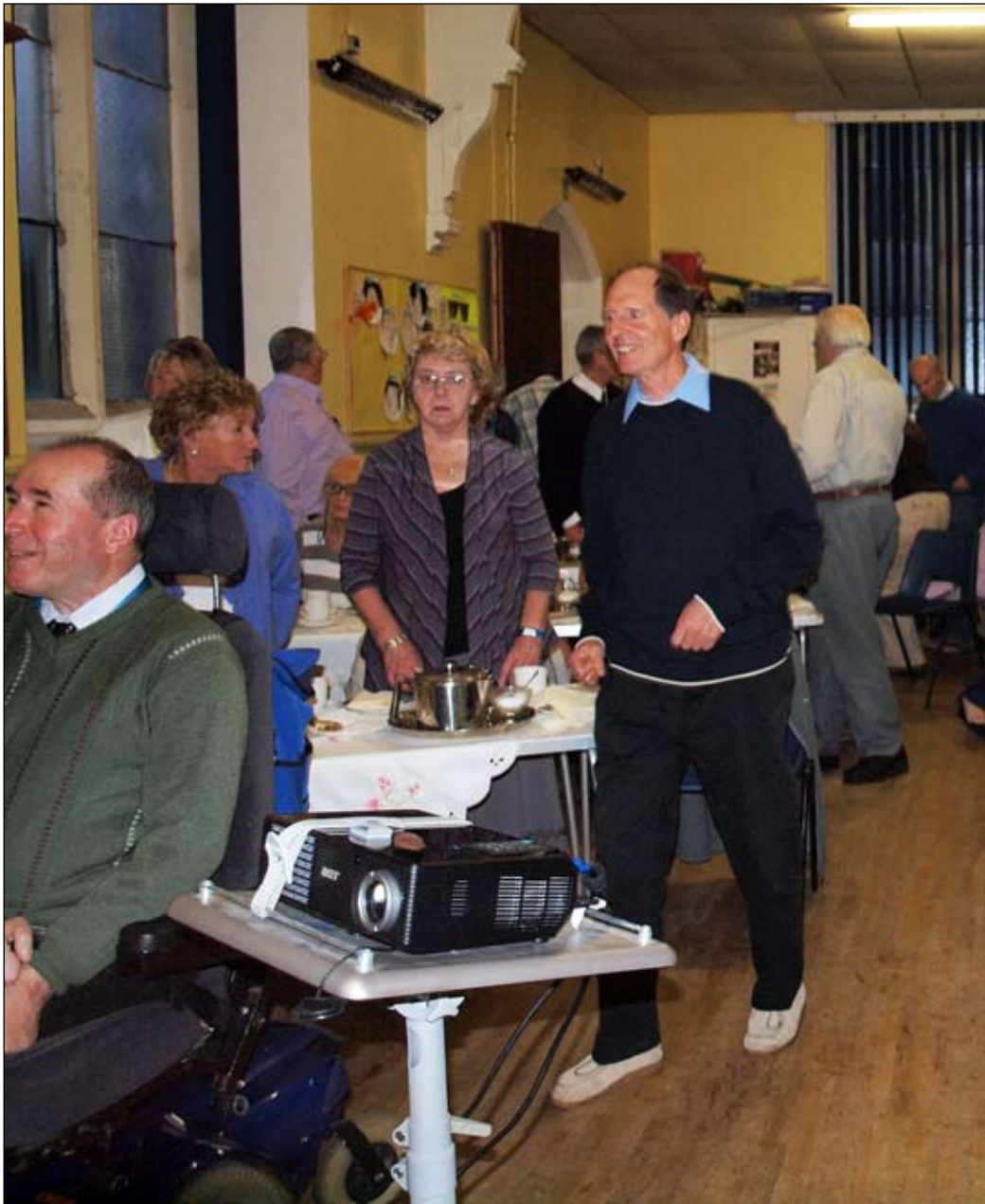
The Exploring Worship service on Sunday 11 September was one with a difference as the photograph