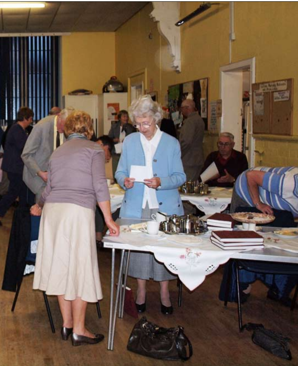
aph, taken shortly after, proves.

r will be on Sunday 6th November at 6.00 pm.