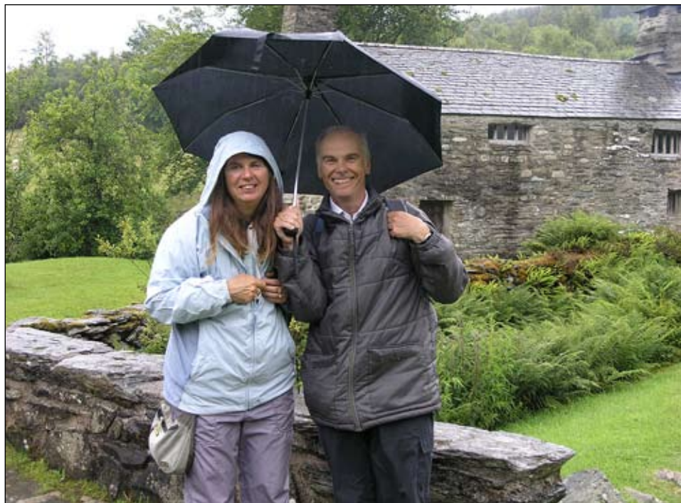
At Ty Mawr.