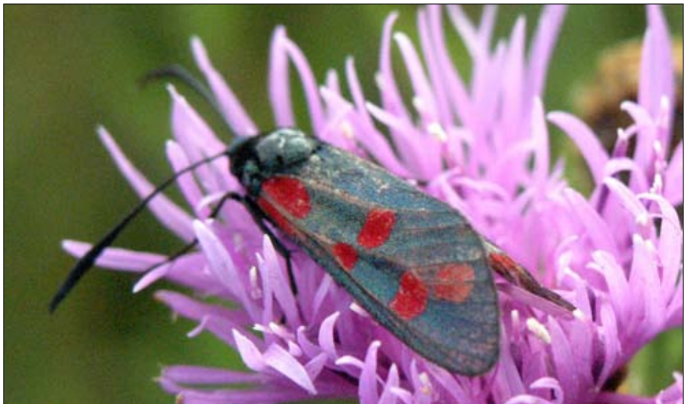
Red burnet moth on Knapweed.