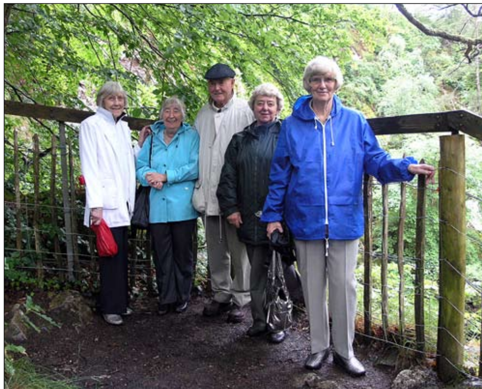
At Conwy Falls.

the church. The church was re-opened in 2009, after being closed for 15 years, and once again forms an important part of village life. The church is open every day and provides a meeting point for the community, while a village fair is held in the church on the first Saturday each month from 10.30 am – 1.00 pm (the Friends' Committee can recommend this, as we visited it on our reconnaissance trip). The day we were visiting was also the Penmachno School fair, so we to end our day we called in at the fair to listen to the choir and band, while shopping at the stalls and chatting to the locals.