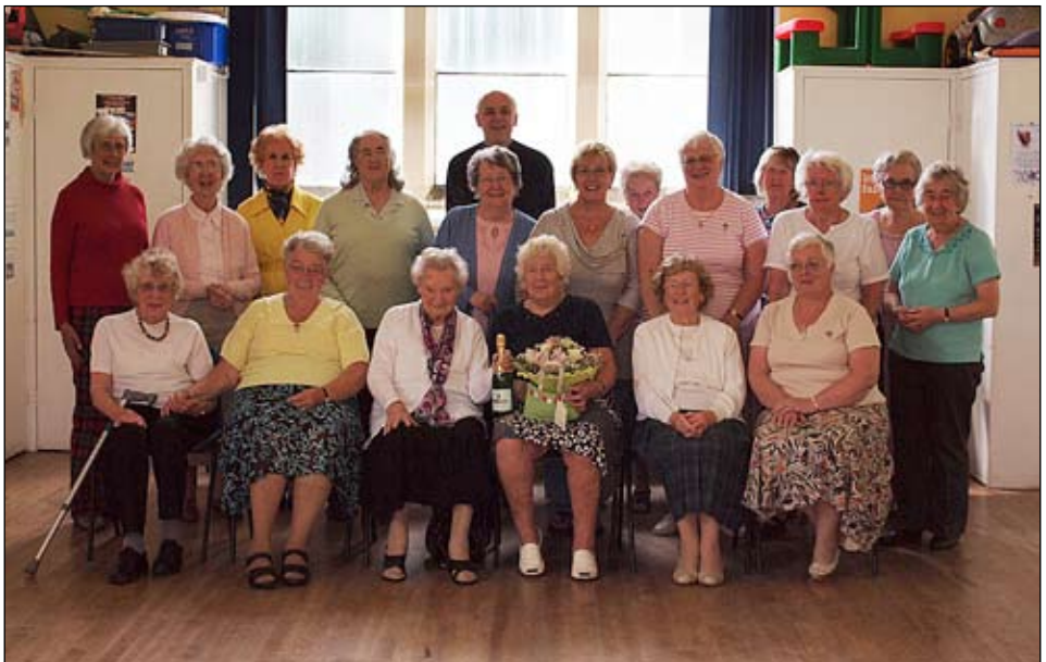
Members of the Mothers' Union on Mary Sumner Day.