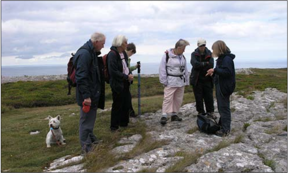
Examining the limestone pavement.

we are lucky to have some nesting on the Orme. The morning had been wet and the weather was still threatening at the beginning of the walk but by late afternoon the sun came out and we had beautiful views over the Conwy Estuary as we completed the walk.