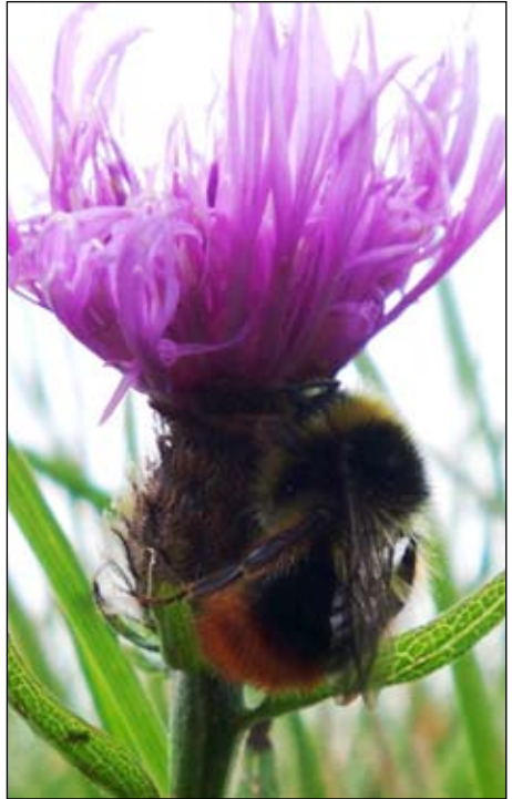
Bumblebee on Knapweed.