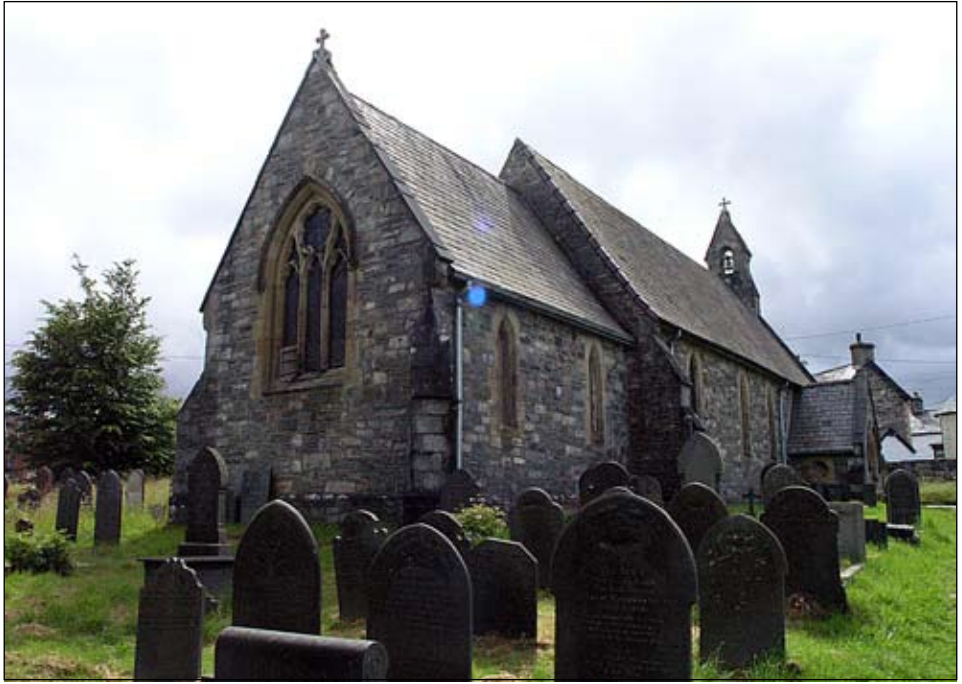
St. Tudclud's Church.

We had a thoroughly enjoyable day and would recommend all the places which we visited, if you have the opportunity to visit them too.