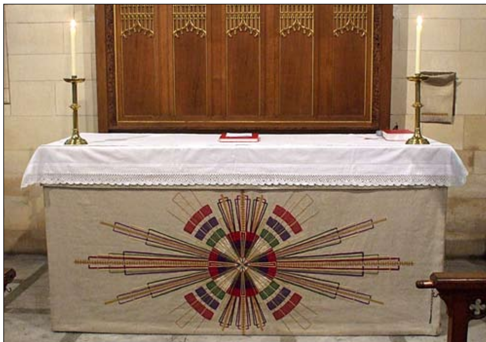
The altar in the Memorial Chapel.