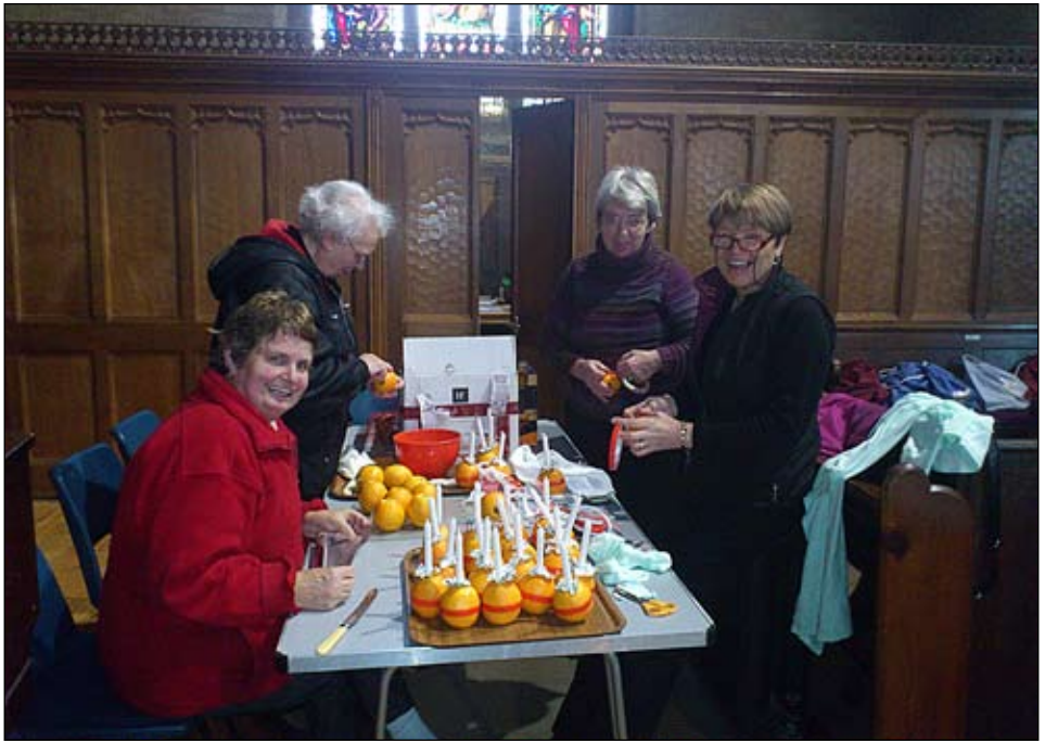
Images taken at the Christingle service on Sunday, 9 December.